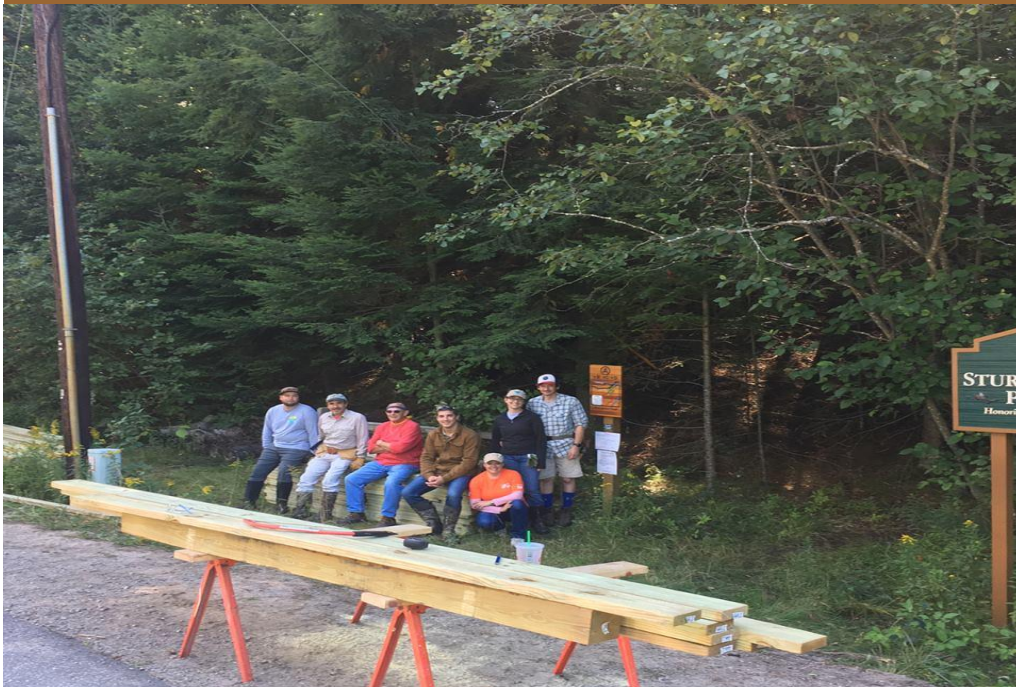
EVENTS-HAPPENINGS-NEWS-THINGS TO SHARE